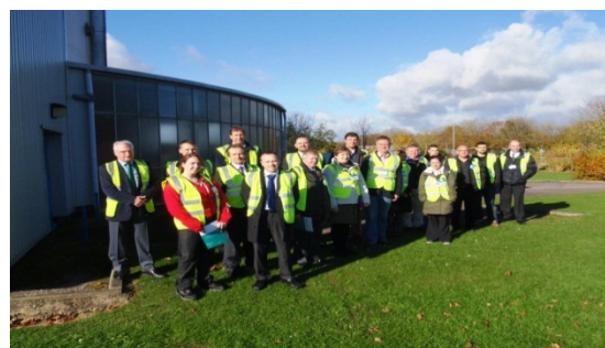
The Harwell event included a visit inside the DIDO reactor

Thank you to all the speakers who took part in our 2012 programme and to the organisations that hosted events on behalf of SAFESPUR